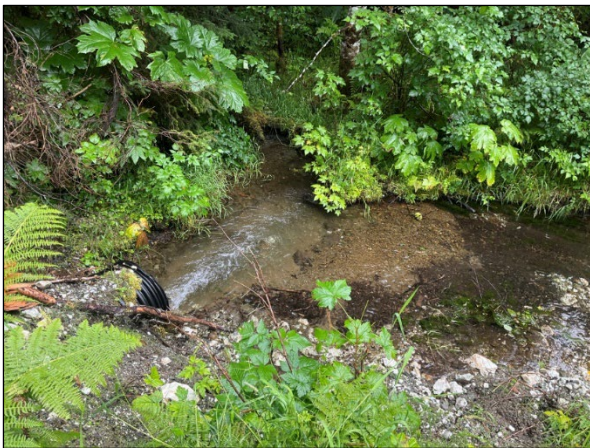
Figure 2.—Channel and culvert at waypoint 1232.