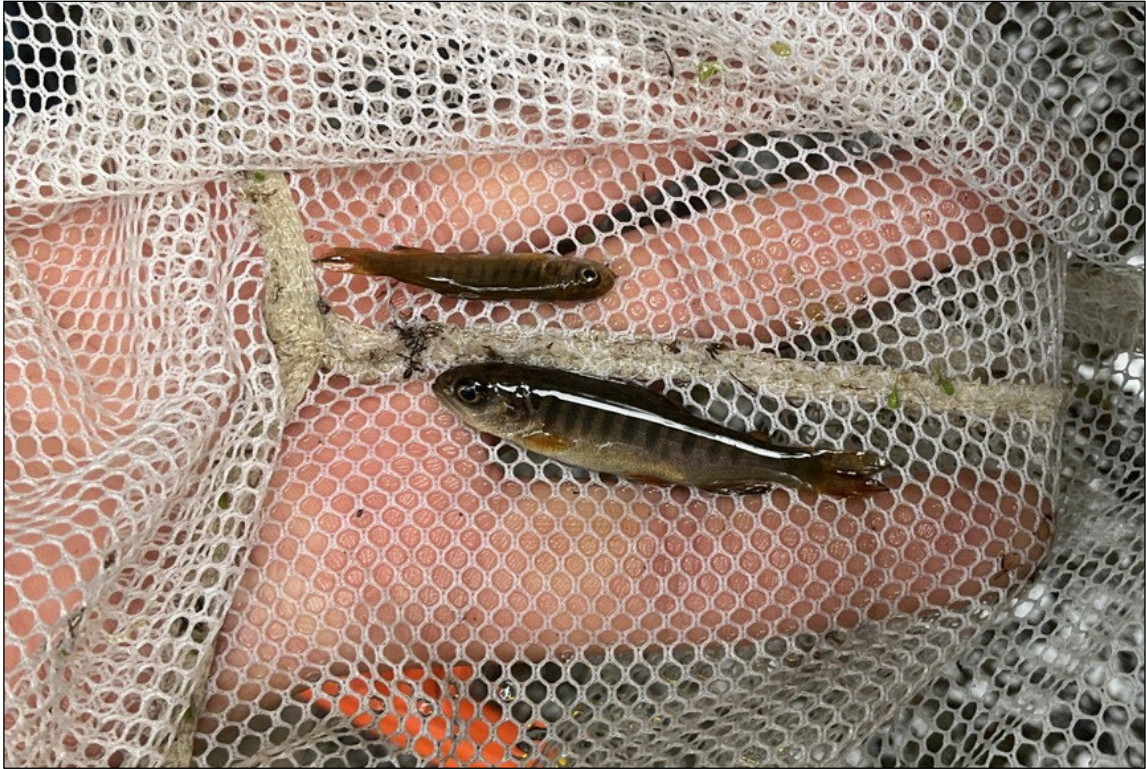
Figure 1.—Juvenile coho salmon captured at waypoint 1233.