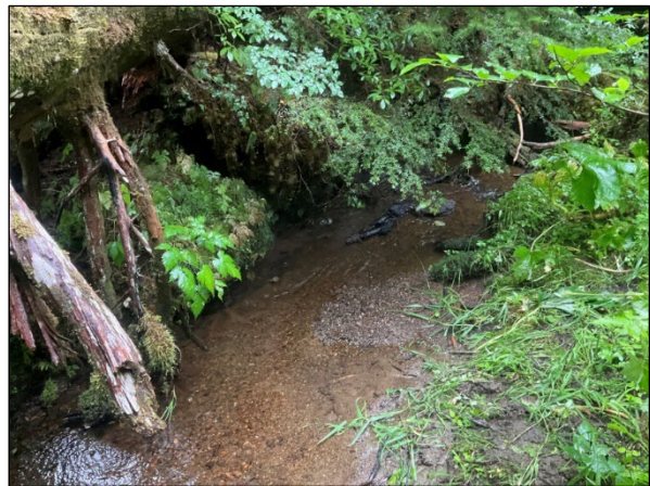
Figure 3.—Channel at waypoint 1234.